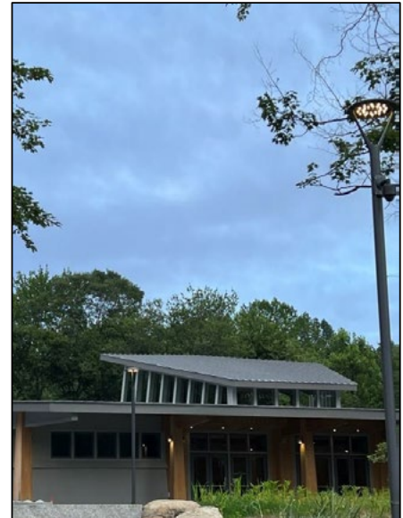
View of the veranda (right) and new south addition façade (left) with new cupola, as seen from the new lower parking lot.