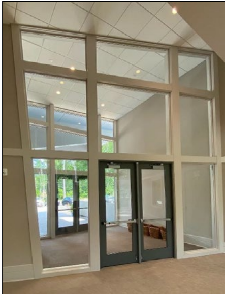
The new entrance to the main lobby, looking from the lobby out the front doors.