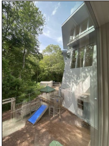
The back wall of the sanctuary – new windows and cupola – from the preschool playground.