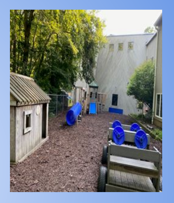
This is our playground!

I can dig in the sandbox, drive the big car, climb and slide on our play structure.