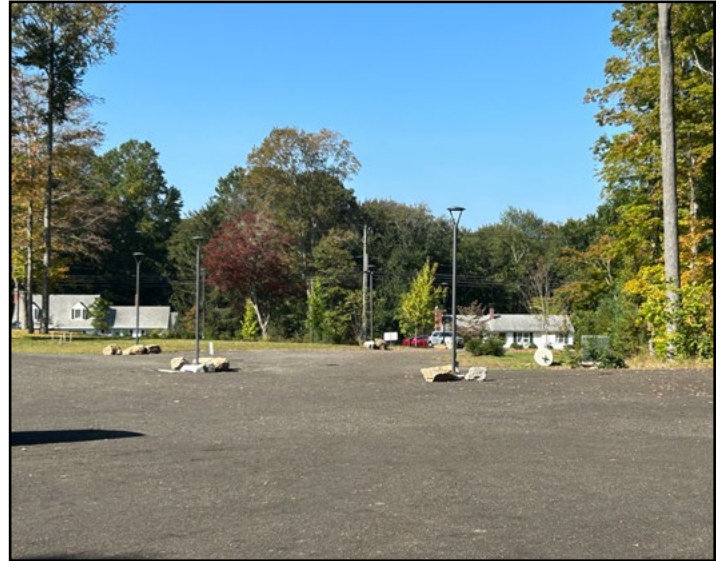
Regraded Parking Lot