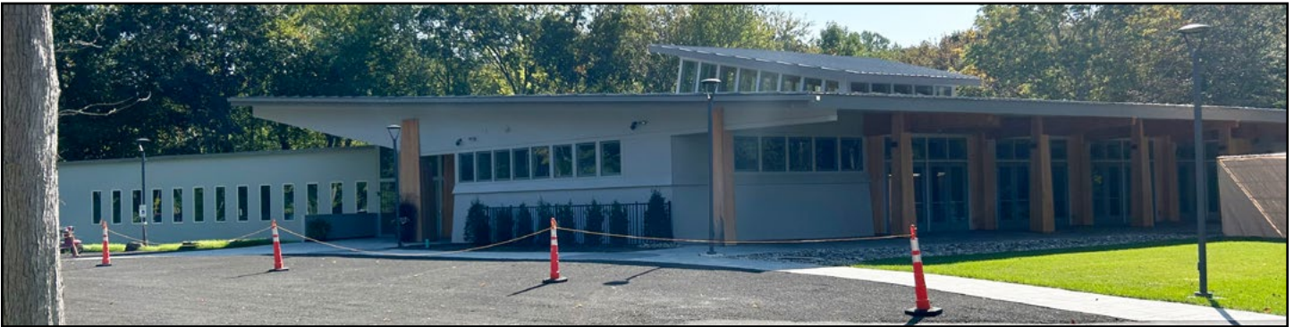
Certificate of Occupancy for Temple Building and Preschool Issued

Have you joined us in Building Community? Now is the Time!