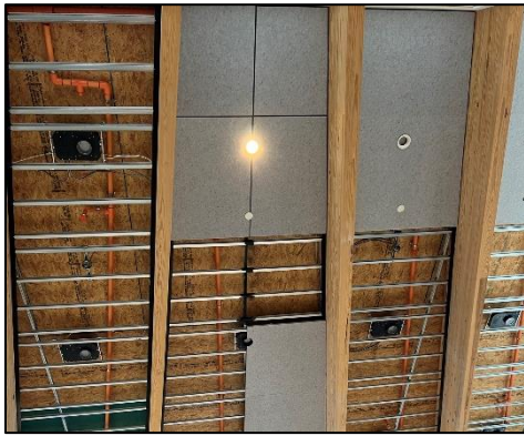
Sanctuary ceiling acoustical tiles