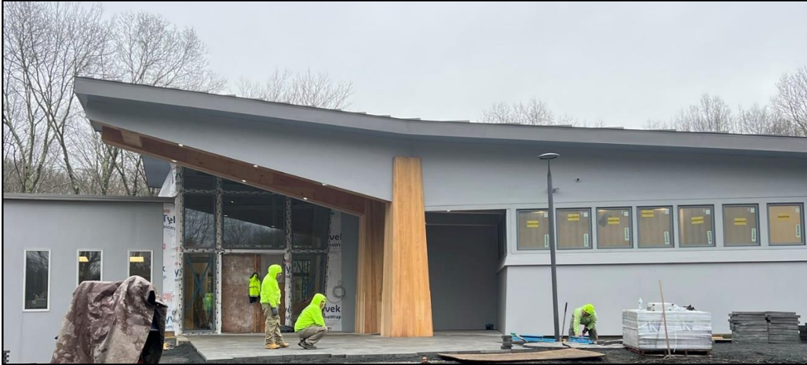
Front entrance stonework being installed