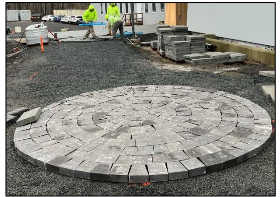
Stonework for front walkway