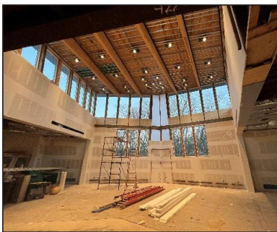
Sanctuary with new Lights