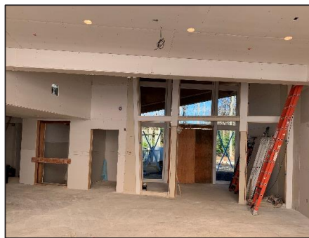
Front entrance with lobby sheetrock