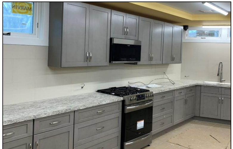
Cabinetry being installed in kitchen