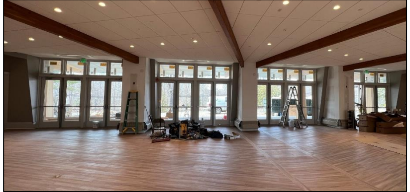
The social hall doors

The sanctuary – the ark will be installed at the beginning of April. Our first service will be held in the sanctuary on Saturday, April 1 at 10 AM.