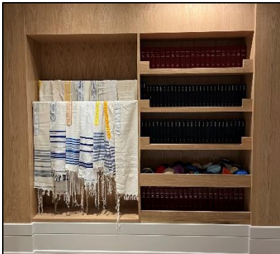
At the sanctuary doors, bookcases and tallis holders